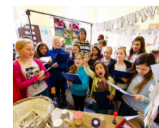
► Kernow Education Arts Partnership (KEAP)

A free and easy to navigate website which saves teachers time when planning and organising school trips - A life saver