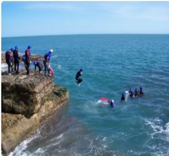
► Cumulus Outdoors