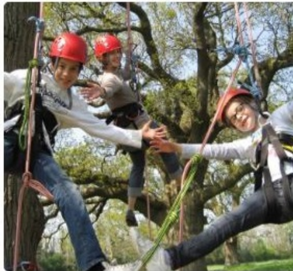
► Allnatt Outdoors