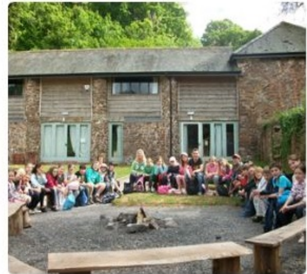
► Warren Barn

teachout.co.uk - the only resource for teachers to plan trips, residentials, transport and in-school visits for students in Cornwall, Devon and Dorset.