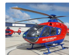
► Devon Air Ambulance